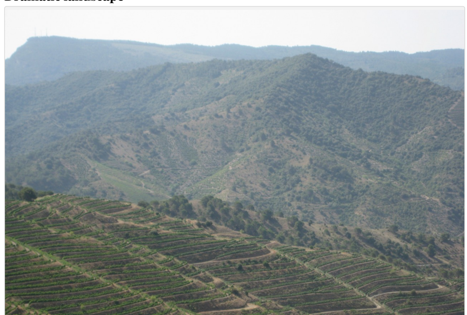
The landscape is dramatic and viticulture is tough in the Priorat region.

The landscape is dramatic and viticulture is tough. You look at steep slopes and narrow terraces and realize how the lure of urban life in nearby Barcelona or Tarragona was irresistible for many of the farmers who had been scraping a living from their vines. But today there is a new appreciation of the quality of Priorat, based on wonderful old vines, Grenache Noir and Carignan, as well as Cabernet Sauvignon, Merlot and Syrah. For white wine, there is Grenache Blanc, Macabeo and Pedro Ximenez, and more recent introductions, such as Chenin Blanc and Viognier.