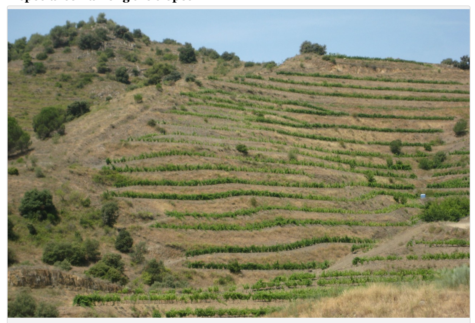
In the region, the intensity of the flavors conjures up the steep hillsides, with alarming gradients.

So what accounts for the typicity of Priorat? There is no doubt the wines convey a strong sense of place. The intensity of the flavors conjures up the steep hillsides, with alarming gradients — a vineyard tour is an exhilarating experience, and certainly not for the faint-hearted without a head for heights. The vineyards follow the contours of the land, so the aspect changes and the altitude varies considerably. Then there is the soil, the characteristic llicorella , which is a type of schist, some 300 million years old. It is this schist that separates Priorat from adjoining DOs such as Montsant and Terra Alta and gives freshness to the wines, balancing the sometime heady alcohol levels that result from the warm