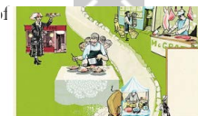
A TASTE OF CORK