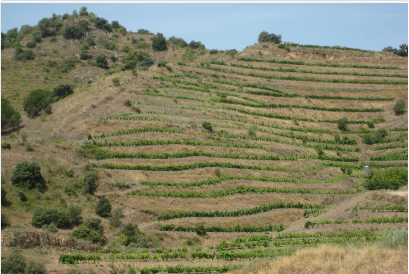
In the region, the intensity of the flavors conjures up the steep hillsides, with alarming gradients.

So what accounts for the typicity of Priorat? There is no doubt the wines convey a strong sense of place. The intensity of the flavors conjures up the steep hillsides, with alarming gradients — a vineyard tour is an exhilarating experience, and certainly not for the faint-hearted without a head for heights. The vineyards follow the contours of the land, so the aspect changes and the altitude varies considerably. Then there is the soil, the characteristic llicorella , which is a type of schist, some 300 million years old. It is this schist that separates Priorat from adjoining DOs such as Montsant and Terra Alta and gives freshness to the wines, balancing the sometime heady alcohol levels that result from the warm summers.