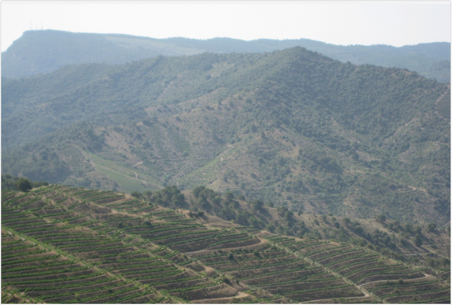
The landscape is dramatic and viticulture is tough in the Priorat region.

The landscape is dramatic and viticulture is tough. You look at steep slopes and narrow terraces and realize how the lure of urban life in nearby Barcelona or Tarragona was irresistible for many of the farmers who had been scraping a living from their vines. But today there is a new appreciation of the quality of Priorat, based on wonderful old vines, Grenache Noir and Carignan, as well as Cabernet Sauvignon, Merlot and Syrah. For white wine, there is Grenache Blanc, Macabeo and Pedro Ximenez, and more recent introductions, such as Chenin Blanc and Viognier.